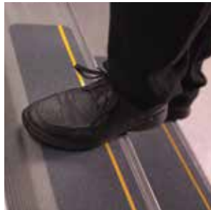
Reflective Stripes on Black