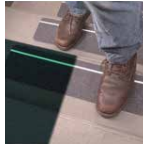
Photoluminescent Stripes on Black